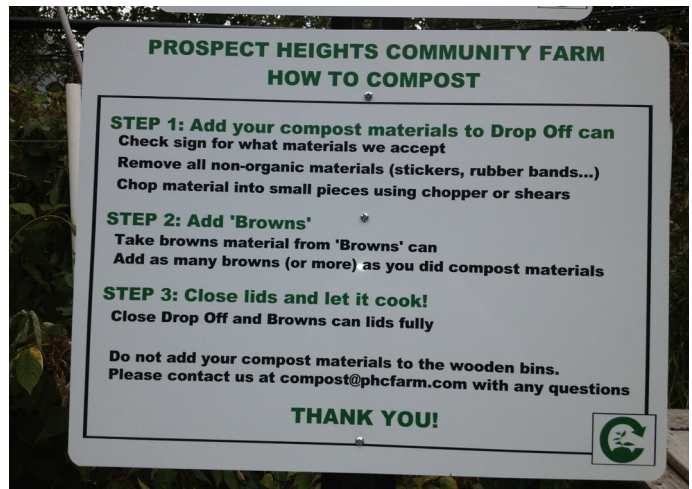
▲ Informational signage guides participants on washing buckets used to store food scraps at the NYC Compost Project hosted by Earth Matter NY.